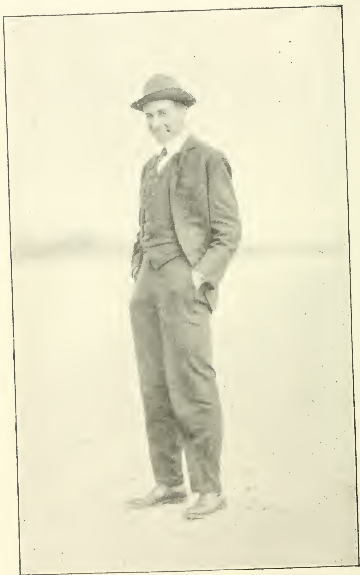
JAMES NORMAN HALL

Photographed by Mrs. Lewis Chase, May, 1916.